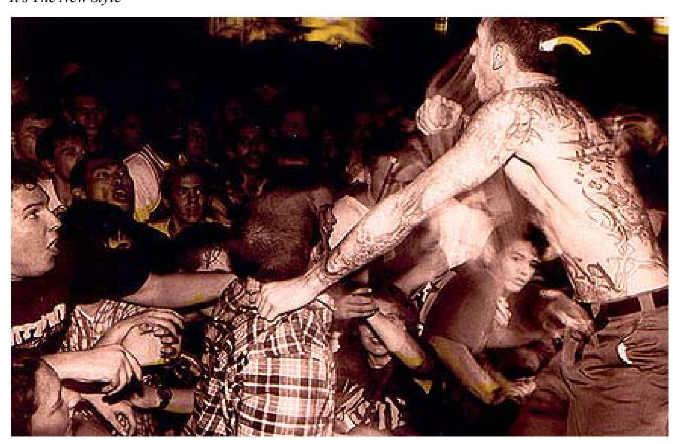
Interview next page..